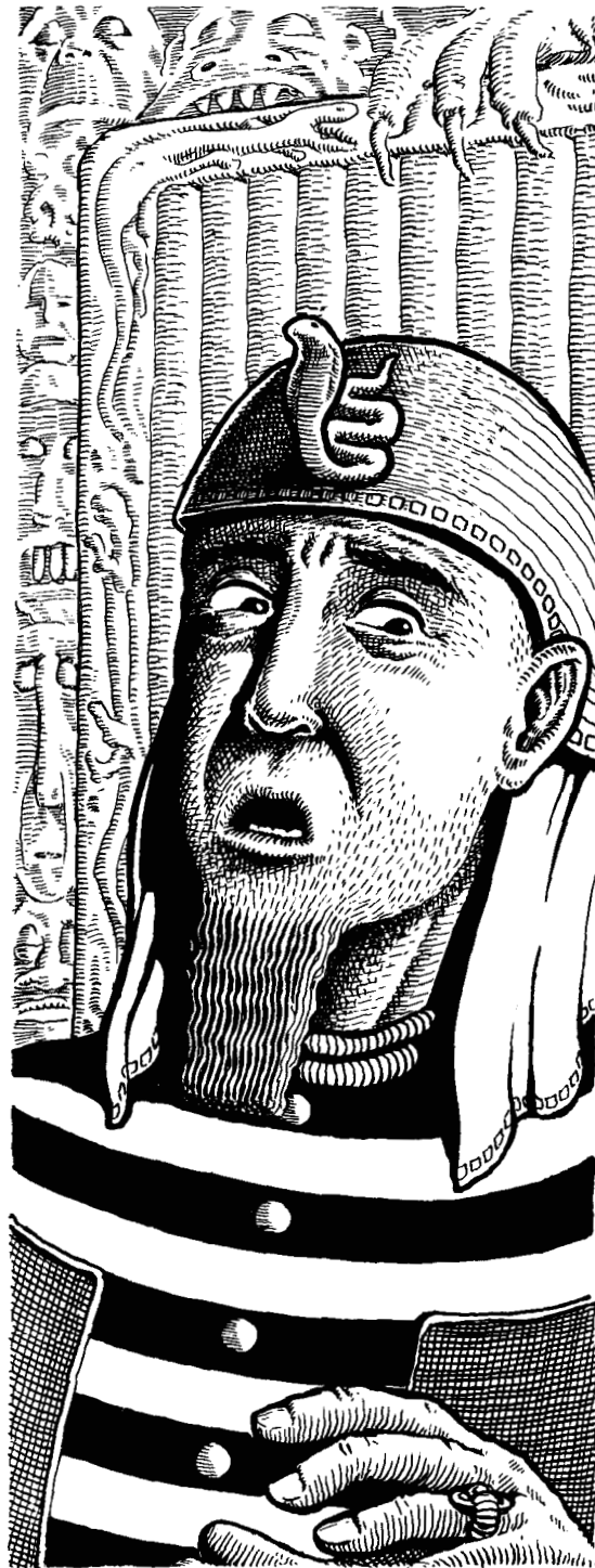
Pharaoh's bearded chin dropped at sight of the thing on the floor.

"I don't think," he told them, "that your God can do any more than our gods can do."