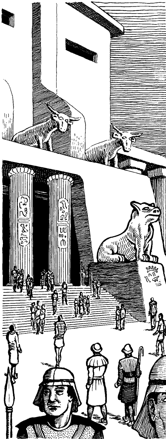
Moses and Aaron obeyed God, and went for the second time to Pharaoh's palace.

Some of them were grinning, as though expecting Moses and Aaron to turn and hurriedly leave in embarrassment.