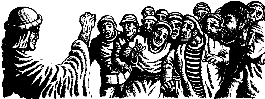
Moses held up his hand for the elders to see that it was only a white, decayed stub.

Now there was silence as Moses held up his right hand for all to see. He put it inside his jacket for a few seconds, then withdrew it to show a white, leprous, decayed hand that brought a chorus of cries of horror from the crowd. A moment later, when